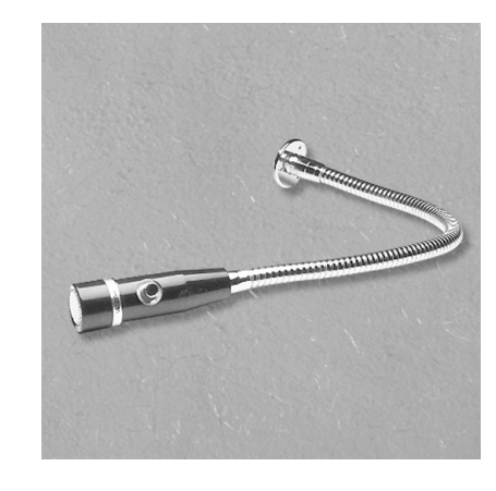
Figure 1 shows the V-450 connected to the Valcom V-9939 microphone adapter.