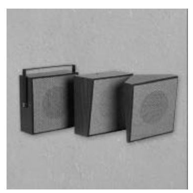
V-1062A, V-1064A. V-1066A