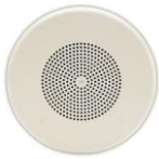
VE4020A Secure One-Way

VE4060A One-Way/Talkback 8" Round Ceiling IP Speaker