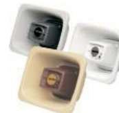
VE4080AL Secure One-Way

Wall IP Speaker Gray w/ Black Grille, Paintable Body