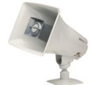
VE130AL Secure One-Way

V-9805 Optional Vandal-Resistant Enclosure