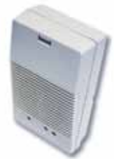
1825 Duet Plus®