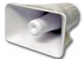
Algo's Optional 1185 Horn Speaker